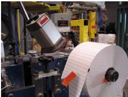
DT-315A Viewing Labeling Machine