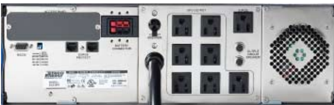
Encore ES2300 120 Volt Rear Panel